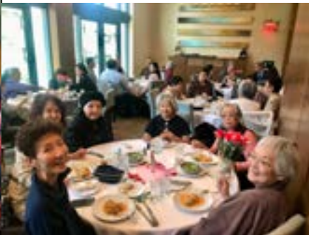
BWA SuperBowl Chirashi and BWA New Year Luncheon

Special Service featuring the Rainbow Connection group.